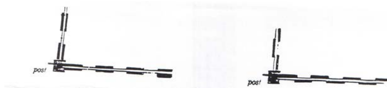
Figure 1: Fencing Diagrams (not to scale)

In Newington Glen, the style may be either board-on-board or alternate board. In Newington Woods and Newington Place, the style is board on board. For detached houses only, all other styles of wood fences will be considered on an individual basis.