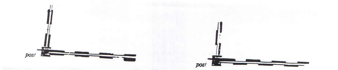
Figure 1: Fencing Diagrams (not to scale)

In Newington Glen, the style may be either board-on-board or alternate board. In Newington Woods and Newington Place, the style is board on board. For detached houses only, all other styles of wood fences will be considered on an individual basis.